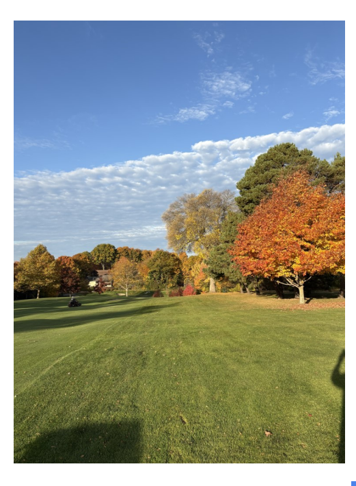
VIEWS On The Course